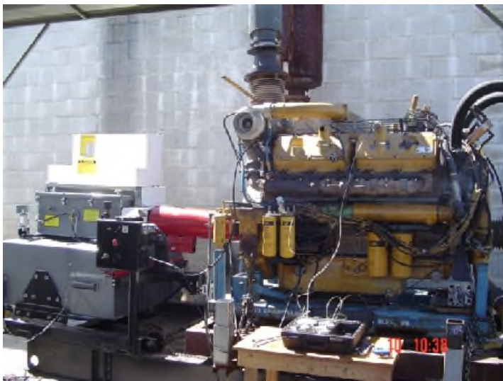
840 hp V12 Caterpillar on I-900 Dyno

The I-900 can test diesel engines, electric motors, gear boxes, transmissions and other high torque/low RPM applications. Other options permit custom-tailoring of the I-900 to your application. In addition, the I-900 can be factory equipped to test unusually high torque/low RPM equipment.